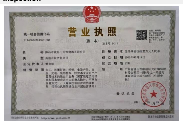
Certification & Photos -- Import and Export Enterprise Registration

Certification & Photos -- Business License (Duplicate) with Certificate / Records of Annual Inspection